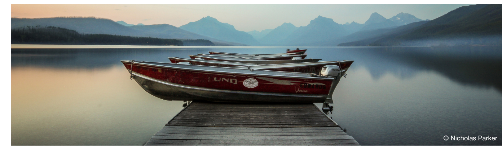
GLACIER COUNTRY TOURISM DESTINATION STEWARDSHIP PLAN | 16

In addition to sharing responsible tourism messaging, Glacier Country Tourism and its partners must also ensure the tourism industry is offering visitors the types of experiences and opportunities that allow them to have a positive impact on local communities.